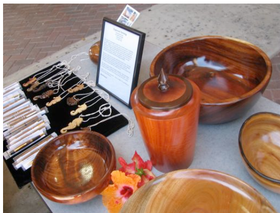
Recovered wood items displayed at Price Waterhouse Cooper's Earth Day event in Tampa.