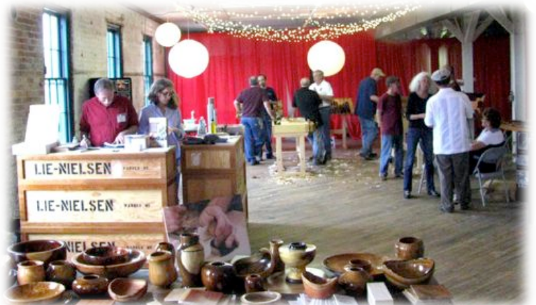
Lie-Nielsen tool event was held in Tampa at the Diaz Cigar Factory Building on N. Albany Ave.