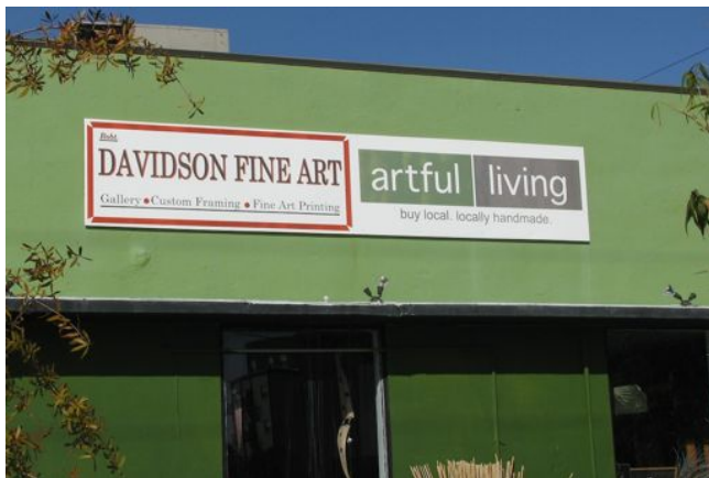
Guild members, craftsman and artists can display their work for sale at Artful Living in St Petersburg at 1100 1st Ave North