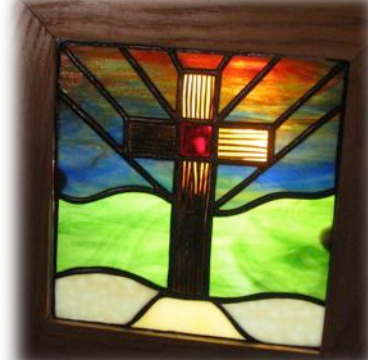
Close up of stained glass.