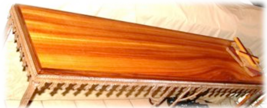
Dale's zebrawood votive table